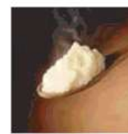
FROZEN MASHED POTATOES