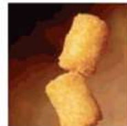
FROZEN TATER DRUMS