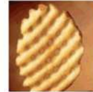
FROZEN LATTICE/BASKET WEAVE CHIPS