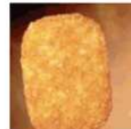
IQF HASH-BROWN PATTIES