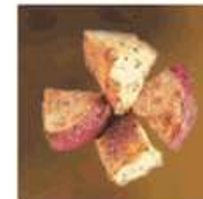
FROZEN SEASONED MEDLEYS