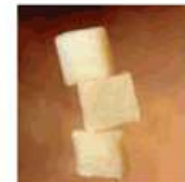
DEHYDRO FROZEN DICES