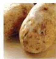
WHOLE FROZEN BAKED POTATOES