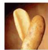
FROZEN HALF SHELLS