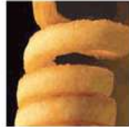
FROZEN LOOP/CURLY FRIES