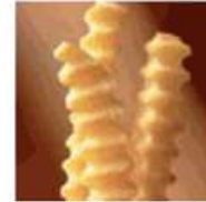
FROZEN CRINKLE-CUT FRIES