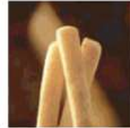
FROZEN STRAIGHT-CUT FRIES