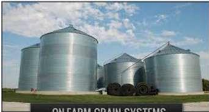
ON-FARM GRAIN SYSTEMS