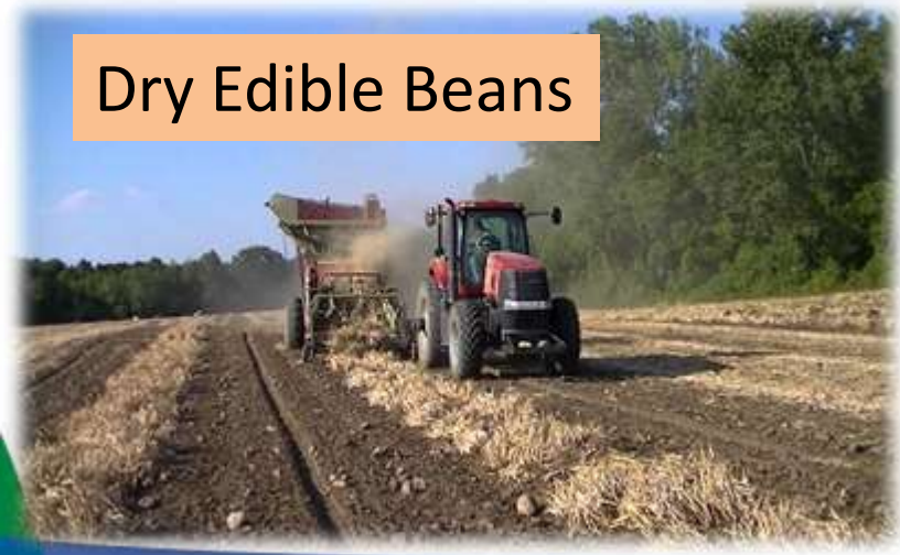
Dry Edible Beans