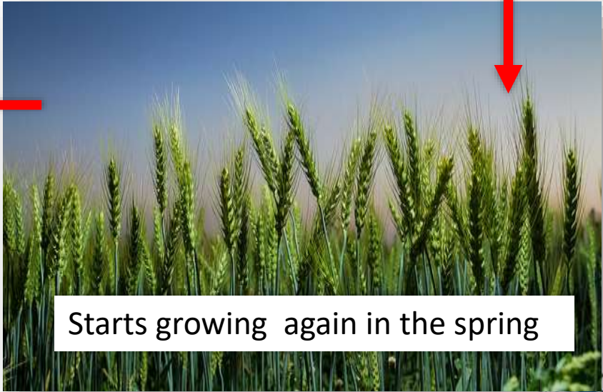
Starts growing again in the spring