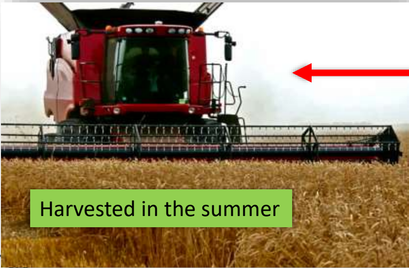
Harvested in the summer