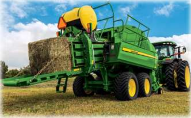
Large Square Bales