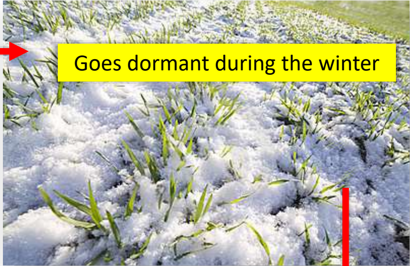
Goes dormant during the winter