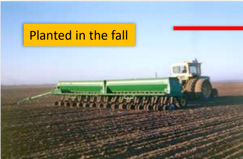
Planted in the fall