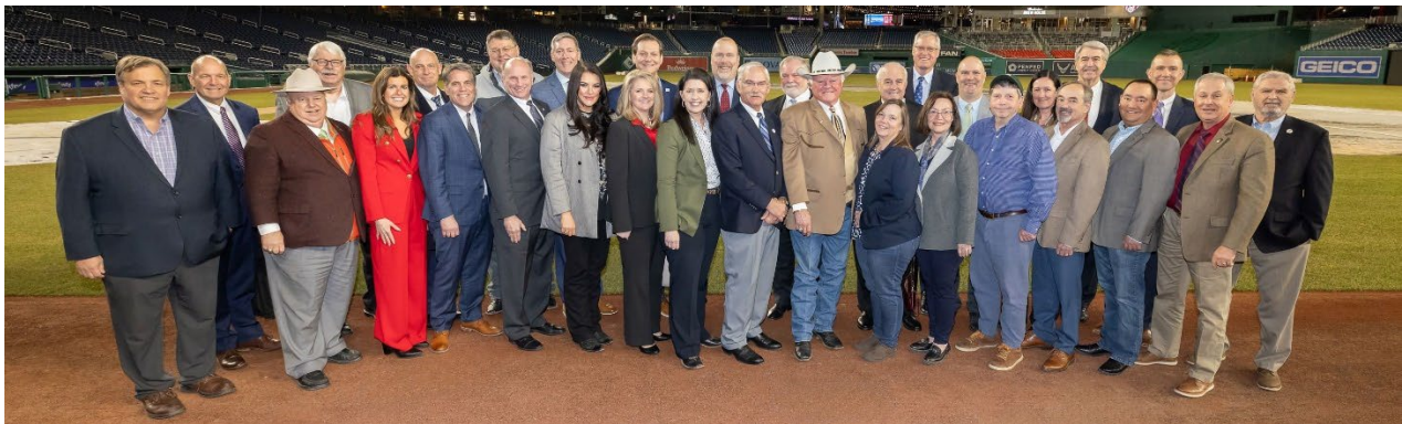
NASDA members pictured at Nationals Park in Washington, D.C. during the 2024 Winter Policy Conference.

The National Association of State Departments of Agriculture has been a leader in the nation's most important agricultural issues since 1916 and continues to give a voice to agriculture across the U.S. NASDA works daily to fulfill its mission of enhancing American food and agricultural communities through policy, partnerships and public engagement.