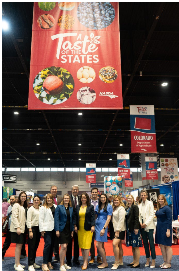
NASDA staff pictured at the 2024 A Taste of the States: Chicago trade show.

Another focus for the NASDA team is gathering reliable, accurate data to inform decisions in the agricultural industry. Since 1972, NASDA has partnered with the U.S. Department of Agriculture's National Agricultural Statistics Service to employ about 2,400 enumerators nationwide. The agricultural statistics collected through this cooperative agreement are essential for planning and administering federal and state programs. Farmers, ranchers and others in agriculture rely on this information for production, supplies, prices and more. Crucial reports, such as the Census of Agriculture, provide data vital for maintaining a strong agricultural economy, guiding investment strategies, making production decisions, and fostering international trade. In 2024, NASDA and NASS launched a strategic plan to upgrade and strengthen operations, aiming to provide more robust statistical services and continue supporting the growth and sustainability of the agricultural sector.